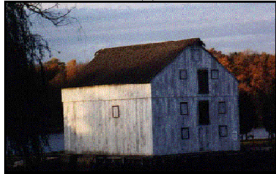
Van Wyck-Lefferts Tide Mill, Huntington, NY

You may know that Huntington Harbor is home to the Van Wyck-Lefferts Tide Mill, but did you know that our mill has the unique distinction of being the only East Coast mill with its building intact, located on his original dam, and still possessed of its original massive wooden gears?